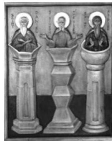
Stylite Saints Daniel, Simeon the Elder and Alypius

* Stylites were also known as “pillar saints” because they chose to live parts of their lives on top of a pillar in prayer and self-sacrifice, deprived of daily comforts and devoted to strict fasts. Their choice to live as hermits in this manner is often seen as a form of self-crucifixion. The Eastern Christian practice began in the Syrian/Mesopotamian regions around the 4th c.