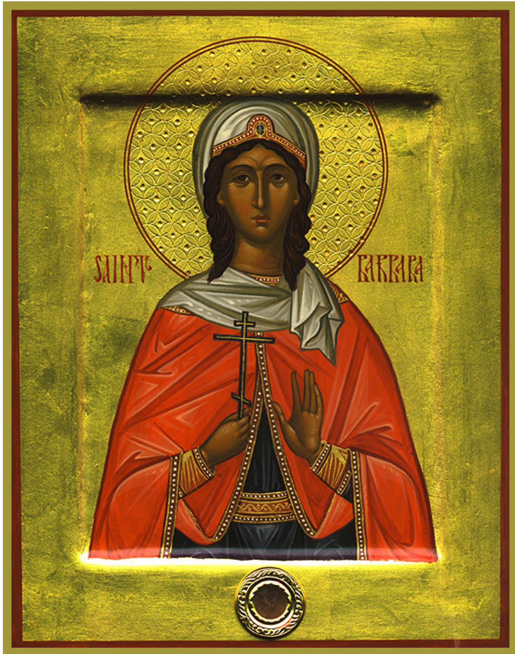
Great Martyr Barbara

St. Nicholas Website: stnicholaspittsfield.org